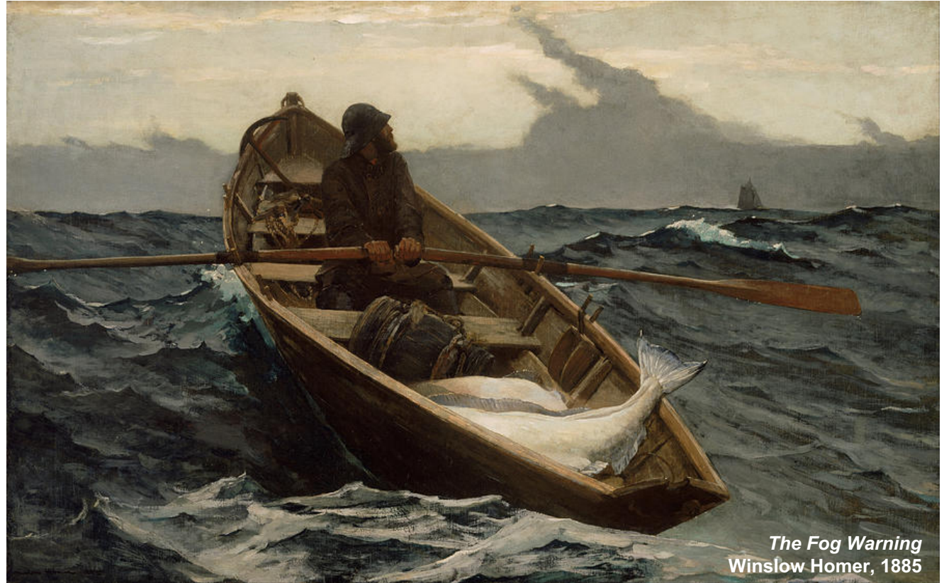
The Fog Warning Winslow Homer, 1885